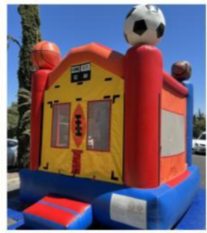
Easter 2023 Easter Brunch Egg Hunt Bounce House And Cotton Candy!